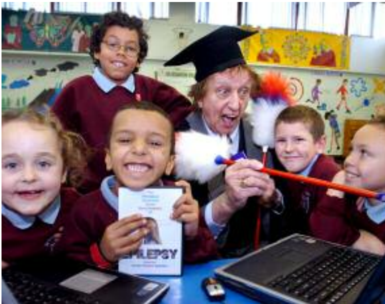
Encyclopaedia is launched by showbusiness legend Ken Dodd OBE

A new CD-Rom aims to help children live positively with epilepsy – with a little help from Handel.